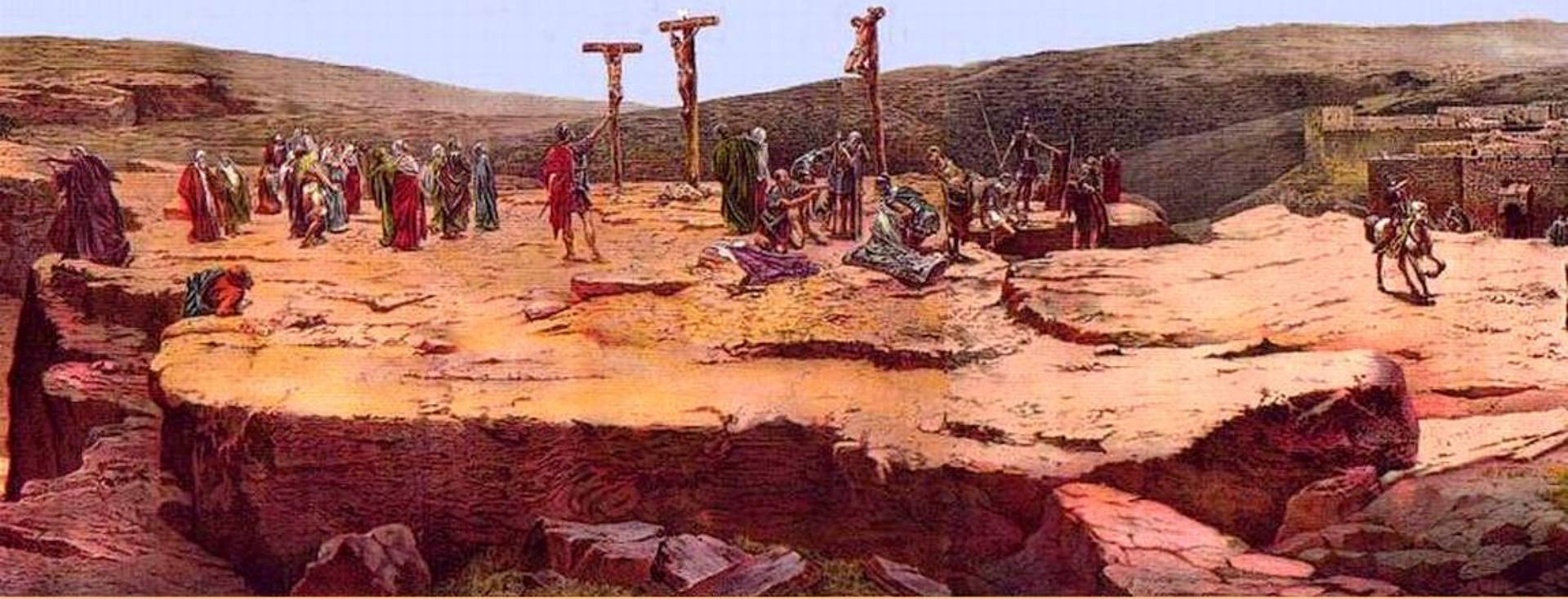
Jan Styka 'The Crucifixion', originally entitled 'Golgotha' The largest framed mounted to canvas painting in the world, 195 feet (59 meters) long, 45 feet (14 meters) high on display in the Hall of the Crucifixion at Forest Lawn Memorial Park Cemetery in Glendale, California