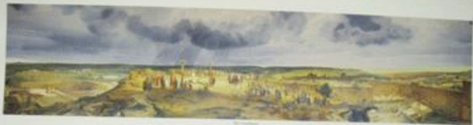
View of the town of ... from the ...